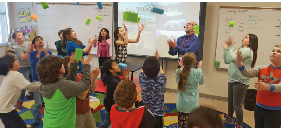
Students at St. Martha in Fort McMurray take a break during their lesson to play a game and stay active.

For every $1 spent on APPLE Schools, $13 in future health care costs are avoided. APPLE Schools can help Alberta save $33 - $82 million annually in avoided health care costs. Developing healthy habits at a young age leads to making healthier choices as adults.